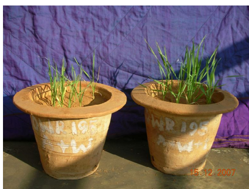
Fig. 3. The effect of Glomus fasciculatum on DWR 195 var. under control and inoculated conditions with acid stress.