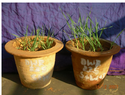
Fig. 2. The effect of Glomus fasciculatum on DWR 225 var. under control and inoculated conditions with salt stress.