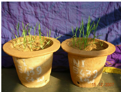
Fig. 1. The effect of Glomus fasciculatum on NI 5439 var. under control and inoculated conditions without stress.